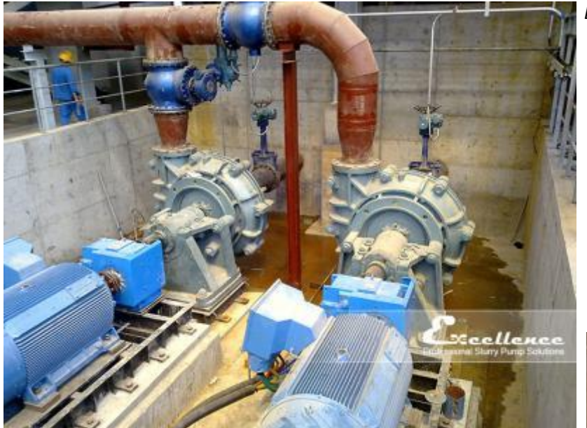
EHM-10ST in Gold Processing Plant in China