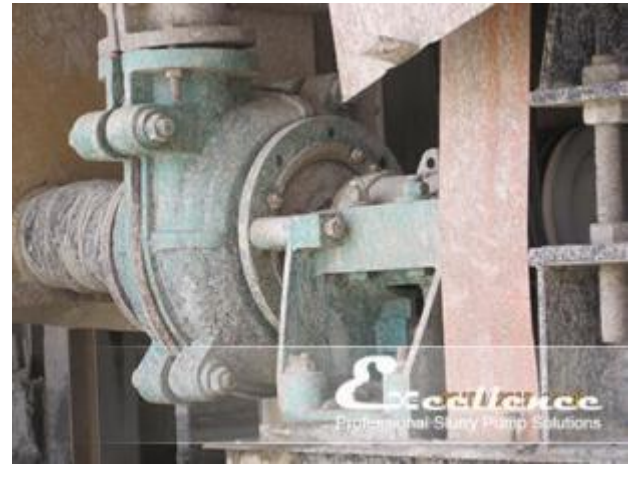
EHM-2C in Copper Concentration Plant in Africa